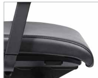
Leather upholstery with decorative stitching