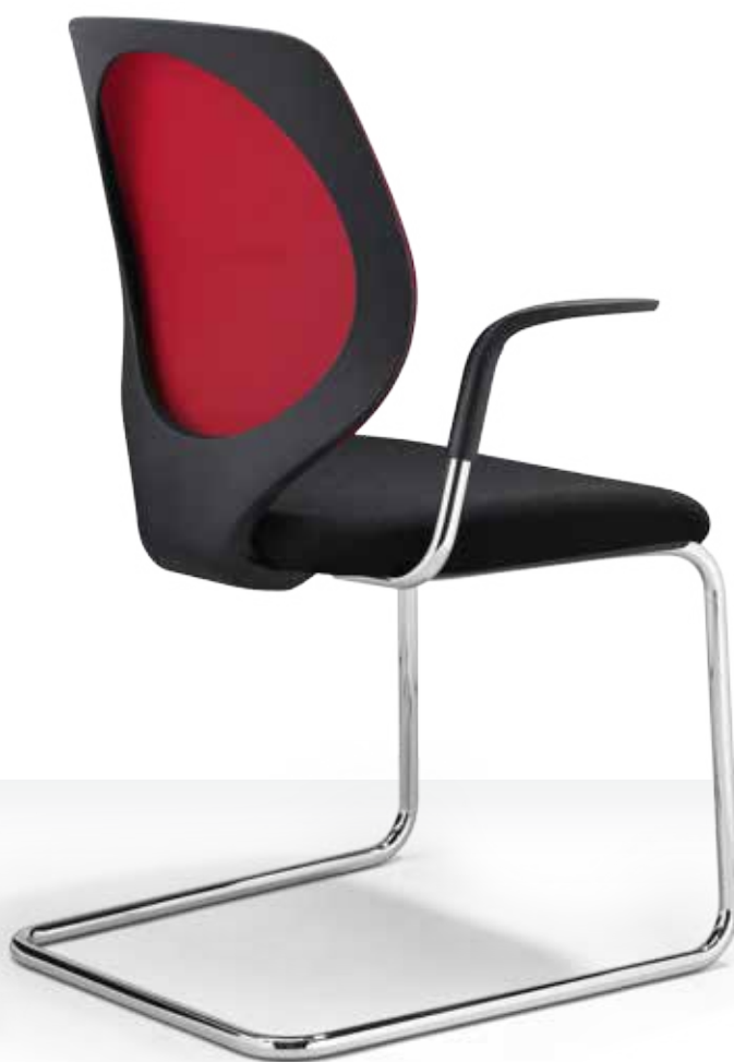
353-7002 → Backrest spacer fabric → Frame chromium-plated