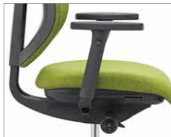
4D armrests plastic support or aluminium support