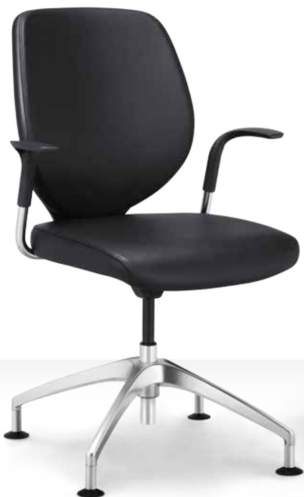
353-7518 → Leather upholstery → 4-arm base in polished aluminium → Glides chromium-plated