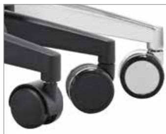
Castors 50 mm black, 65 mm black or chromium-plated