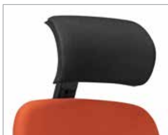
Headrest mesh or upholstered